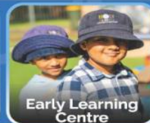
Early Learning Centre