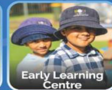
Early Learning Centre