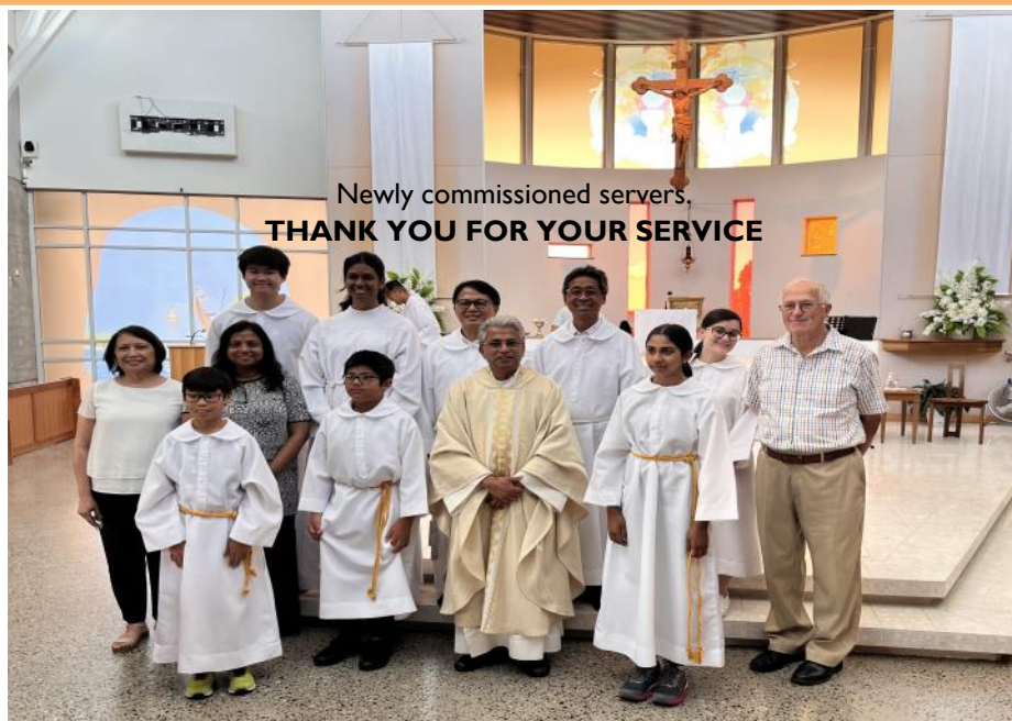
Newly commissioned servers. THANK YOU FOR YOUR SERVICE

For further information please contact the Parish Office.