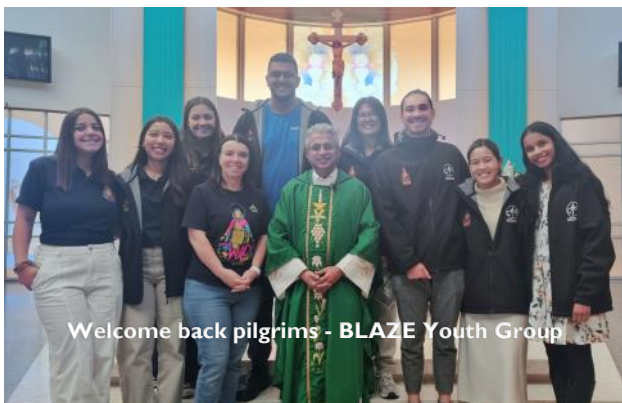
Welcome back pilgrims - BLAZE Youth Group

Now that the church is open for celebrations, its floors need to be swept of dust, cobwebs brushed off, candle stands cleaned and garden kept green. We would like to request all our volunteer cleaners and gardeners to come back and continue their ministry. For more information contact maintenance@john23rd.org.au or the parish office.