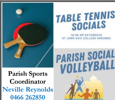
TABLE TENNIS SOCIALS