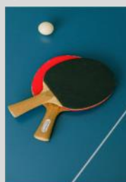
TABLE TENNIS SOCIALS

10:00 AM SATURDAYS ST JOHN XXIII COLLEGE GROUNDS