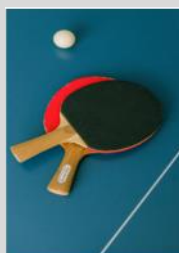
TABLE TENNIS SOCIALS

10:00 AM SATURDAYS ST JOHN XXIII COLLEGE GROUNDS