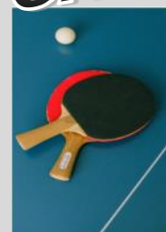
TABLE TENNIS SOCIALS

10:00 AM SATURDAYS ST JOHN XXIII COLLEGE GROUNDS