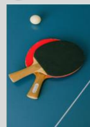
TABLE TENNIS SOCIALS

10:00 AM SATURDAYS ST JOHN XXIII COLLEGE GROUNDS