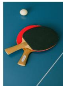
TABLE TENNIS SOCIALS

10:00 AM SATURDAYS ST JOHN XXIII COLLEGE GROUNDS