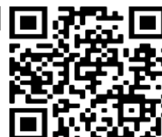
QR code for

The Parish Finance Committee encourages all parishioners to register for direct debit or credit card deductions instead of the envelope system.