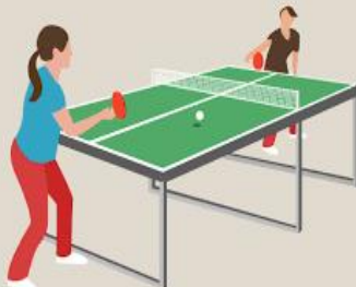
TABLE TENNIS SOCIALS

We are looking for expressions of interest to join us for another sports social - table tennis/ping pong.