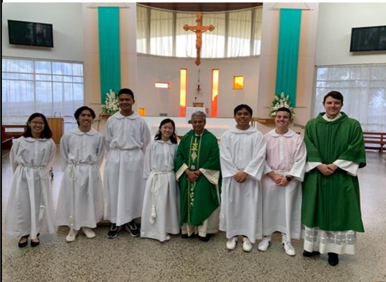
The parish community thanks you for your continued service.