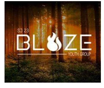
CRL (Community of the Risen Lord)