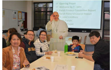
Look who dropped in