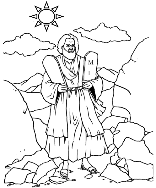
The Law was given through Moses